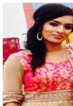
Women Representative Rimmy Guram